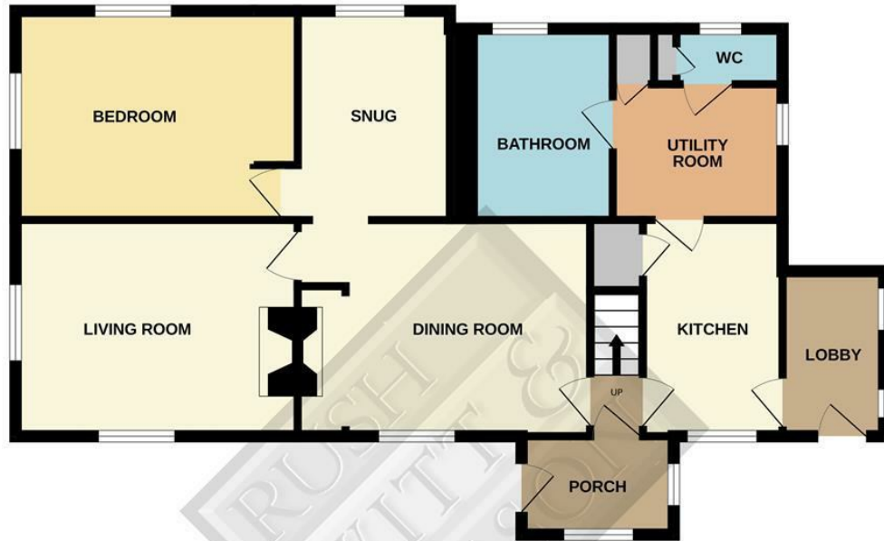
1ST FLOOR 397 sq.ft. (36.8 sq.m.) approx.