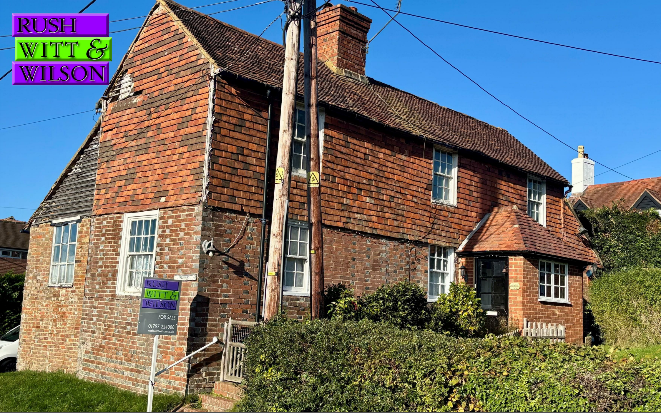
Nedrabs Pett Road, Pett, East Sussex TN35 4HA Offers In Excess Of £399,950