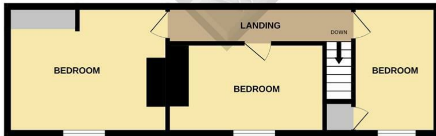
TOTAL FLOOR AREA: 1184 sq.ft. (110.0 sq.m.) approx.

Whilst every attempt has been made to ensure the accuracy of the floorplan contained here, measurements of doors, windows, rooms and any other items are approximate and no responsibility is taken for any error, omission or mis-statement. This plan is for illustrative purposes only and should be used as such by any prospective purchaser. The services, systems and appliances shown have not been tested and no guarantee as to their operability or efficiency can be given. Made with Metropix ©2025